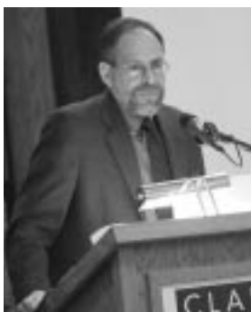
Benjamin Lieberman, author of Terrible Fate: Ethnic Cleansing in the Making of Modern Europe

Ethnic cleansing and mass violence occurred in a variety of political contexts in 20th-century Europe, but universal to all situations was the involvement of ordinary people at all levels of repression.