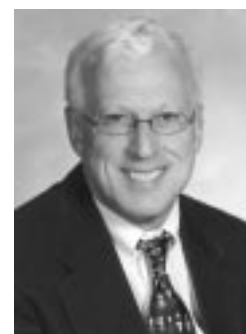
Robert Sternberg, Dean of the School of Arts and Sciences at Tufts University and the director of the Center for the Psychology of Abilities, Competencies, and Expertise at Yale University

“I was most impressed with the Center. The people obviously care about and support each other, and the intellectual atmosphere just comes alive. Really, what a wonderful place!”