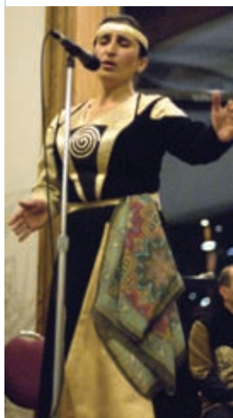
Shoghaken Ensemble performer