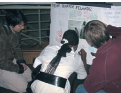
A STAND letter-writing campaign