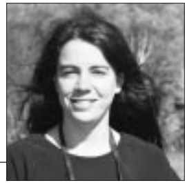
Israeli scholar Galia Glasner