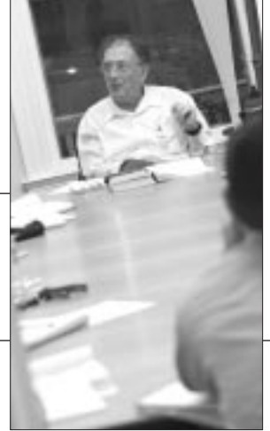
Dr. Yehuda Bauer teaching one of his courses at Cohen-Lasry House

Dr. Yehuda Bauer is an internationally respected scholar and teacher, but at the Center, he's also a member of the family. Bauer was back at the Center for the fall 2004 semester, during which he taught courses and delivered a public lecture to a standing-room-only audience (see story page 3).