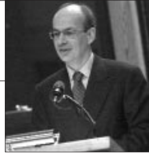
Gijs de Vries, Counter-Terrorism Coordinator for the European Union

The Center was honored to host Gijs de Vries , Counter-Terrorism Coordinator for the European Union, for his only public speaking engagement in the United States last fall. De Vries presented “Counter-Terrorism Action and Human Rights Protection” on 17 October 2004 to a packed crowd in Clark’s Tilton Hall.