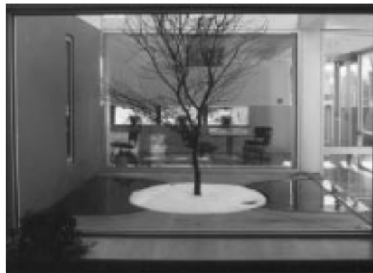
View from the Rose Library at Cohen-Lasry House

bombing of the Association Mutuel Isrealita Argentina, the main center for Jewish life in Buenos Aires. His current project, again in collaboration with Wodiczko, is a very large, complex, and highly significant public monument in Nantes, France, to commemorate the French abolition of slavery and, at the same time, the persistence of slavery today. □