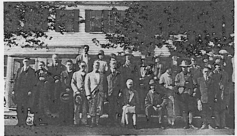
Fig. 1.—"THE GANG" AT WELLFLEET, MASS.