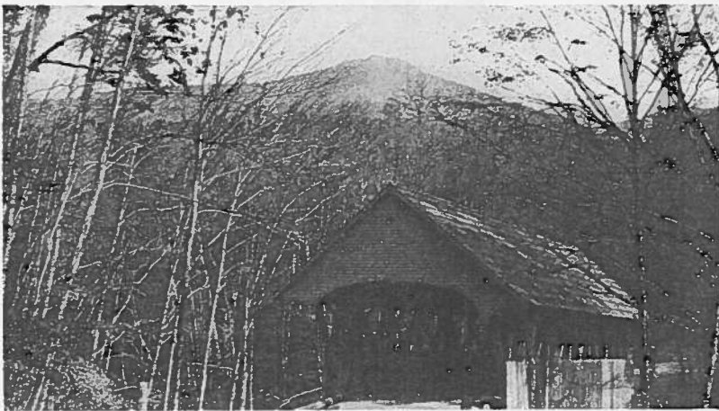
Fig. 3.—A characteristic scene from the White Mountain Country. Everything "under cover", even the bridges.