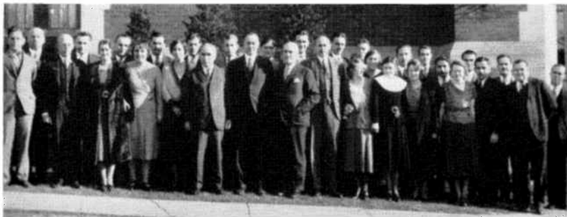
GRADUATE SCHOOL OF GEOGRAPHY 1932-33