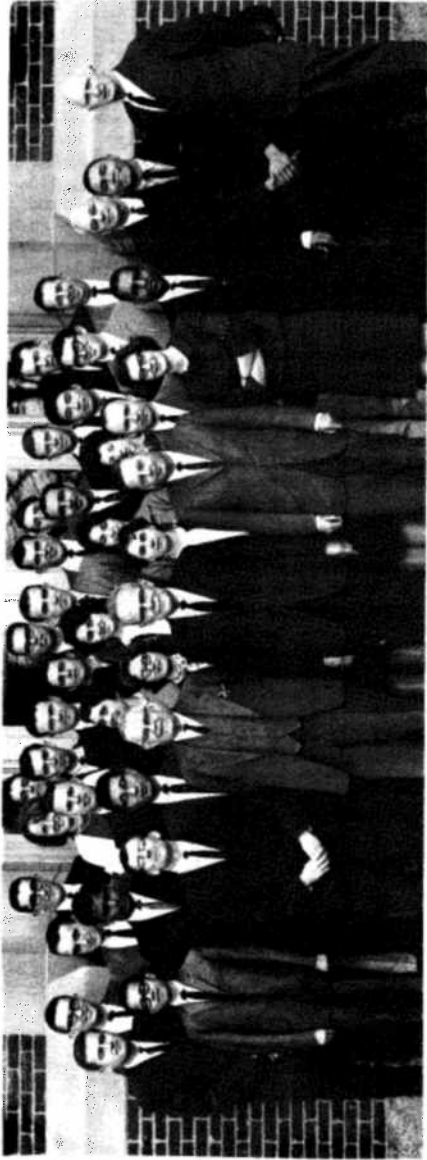
THE GRADUATE SCHOOL OF GEOGRAPHY 1965-1966