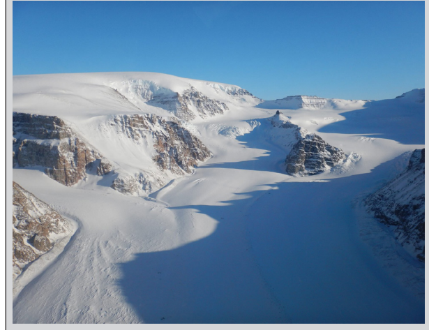
View from the helicopter on the way to the coring site on Nuussuaq Peninsula near Qaarsut, West Greenland.

It was bright blue skies and the warmest day we had had so far at -11°C. All we could see for miles were ice caps and mountain peaks poking through valleys full of clouds. I realized then that this was the closest I would ever get to being on top of the world.